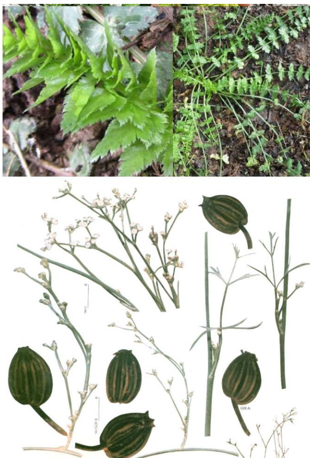
Fig. 1. Used part (vegetative organs = above) and generative organs (inflorescent = below) of Froriepia subpinnata