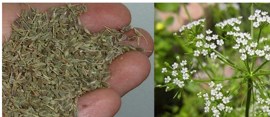
Fig. 2. Used part of used part (Seeds = left) and generative organs (inflorescent = right) of Pimpinella anisum